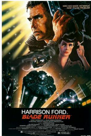
Figure 2: Blade-Runner directed by Ridley Scott (1982).