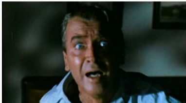
Figure 1: Vertigo directed by Alfred Hitchcock (1958).